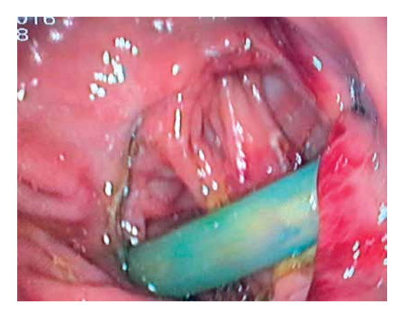
Figure 1. Endoscopy indicates the drain that had migrated into the gastrojejunostomy site

surgical procedure because of malignity (esophagus, pancreas, common bile duct, stomach, and rectum), while 4 had surgery because of Crohn's disease, sigmoid diverticulitis, splenic rupture, and hepatic hydatid cyst. Only 3 of these patients had lower gastrointestinal (GI) system surgery.